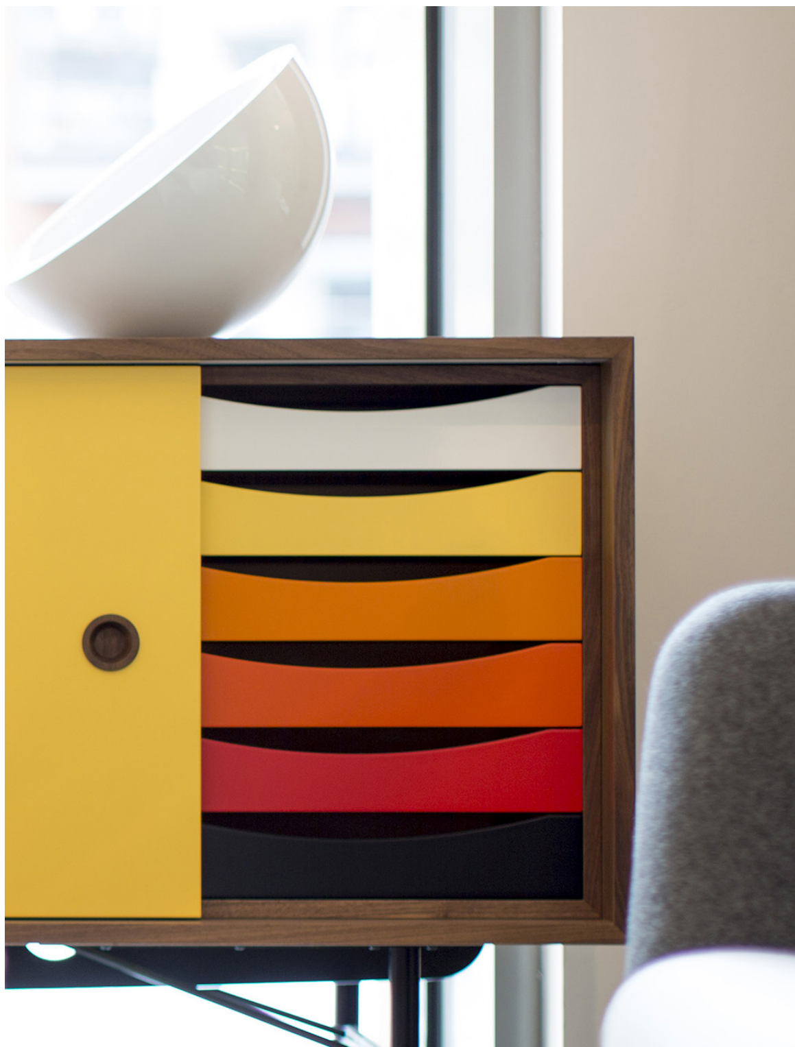
SIDEBOARD 1955 BY FINN JUHL