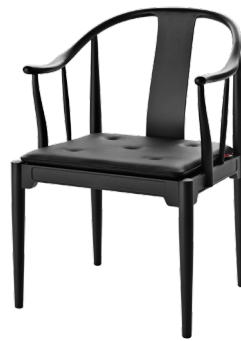
BLACK COLOURED ASH