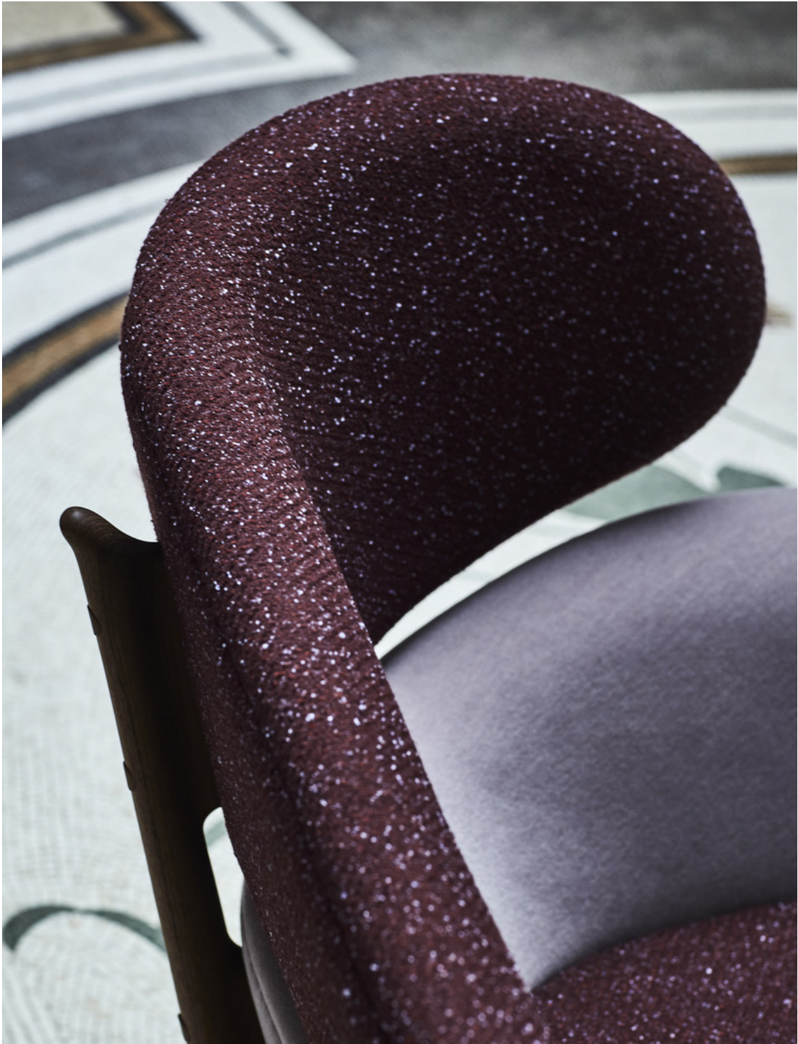
BAKER SOFA 1951 BY FINN JUHL