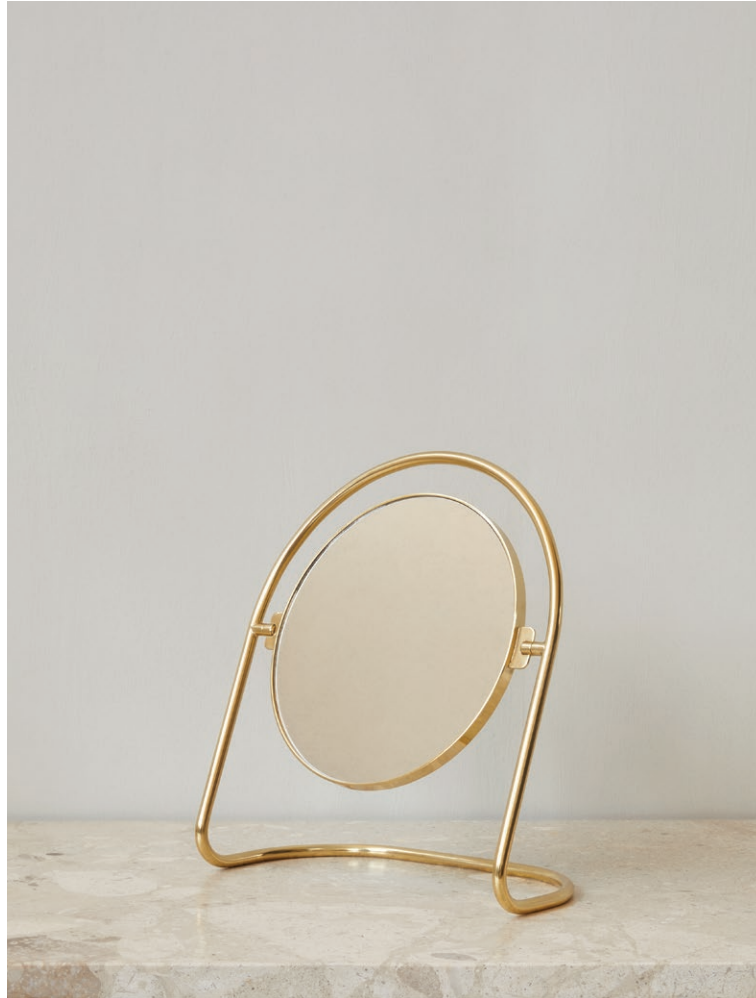
NIMBUS TABLE MIRROR Designed by Krøyer-Sætter-Lassen