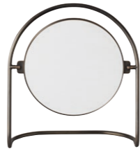
BRONZED BRASS 8033859