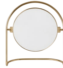
POLISHED BRASS 8033839

Designed for Audo by Krøyer-Sætter-Lassen, the Nimbus Table Mirror in polished or bronzed brass updates the classic looking glass to modern sensibilities. More than just a mirror, the gently curved halo-like stand brings elegance and visual intrigue to spaces, making it as beautiful to look at as it is to look into.