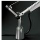
TOLOMEO SUPP.TAVOLO FISSO A004200