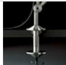
TOLOMEO MORSETTO A004100