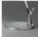
TOLOMEO BASE TV ALL D230 A004030