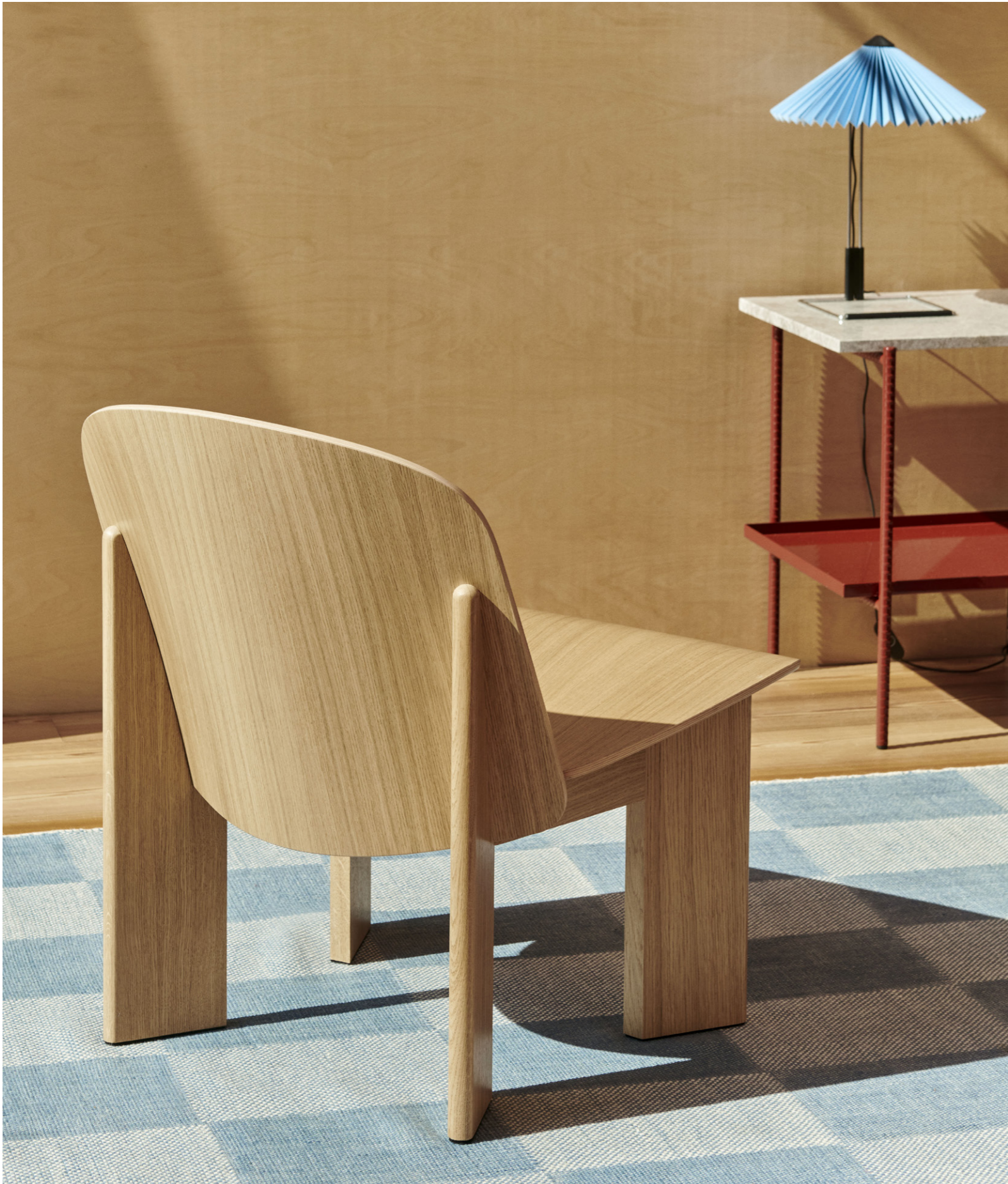
Chisel Lounge Chair | Water-based lacquered oak