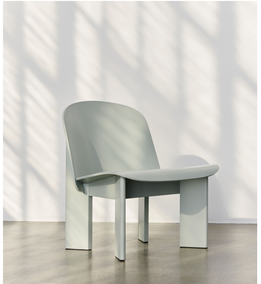
Chisel Lounge Chair | Eucalyptus water-based lacquered beech