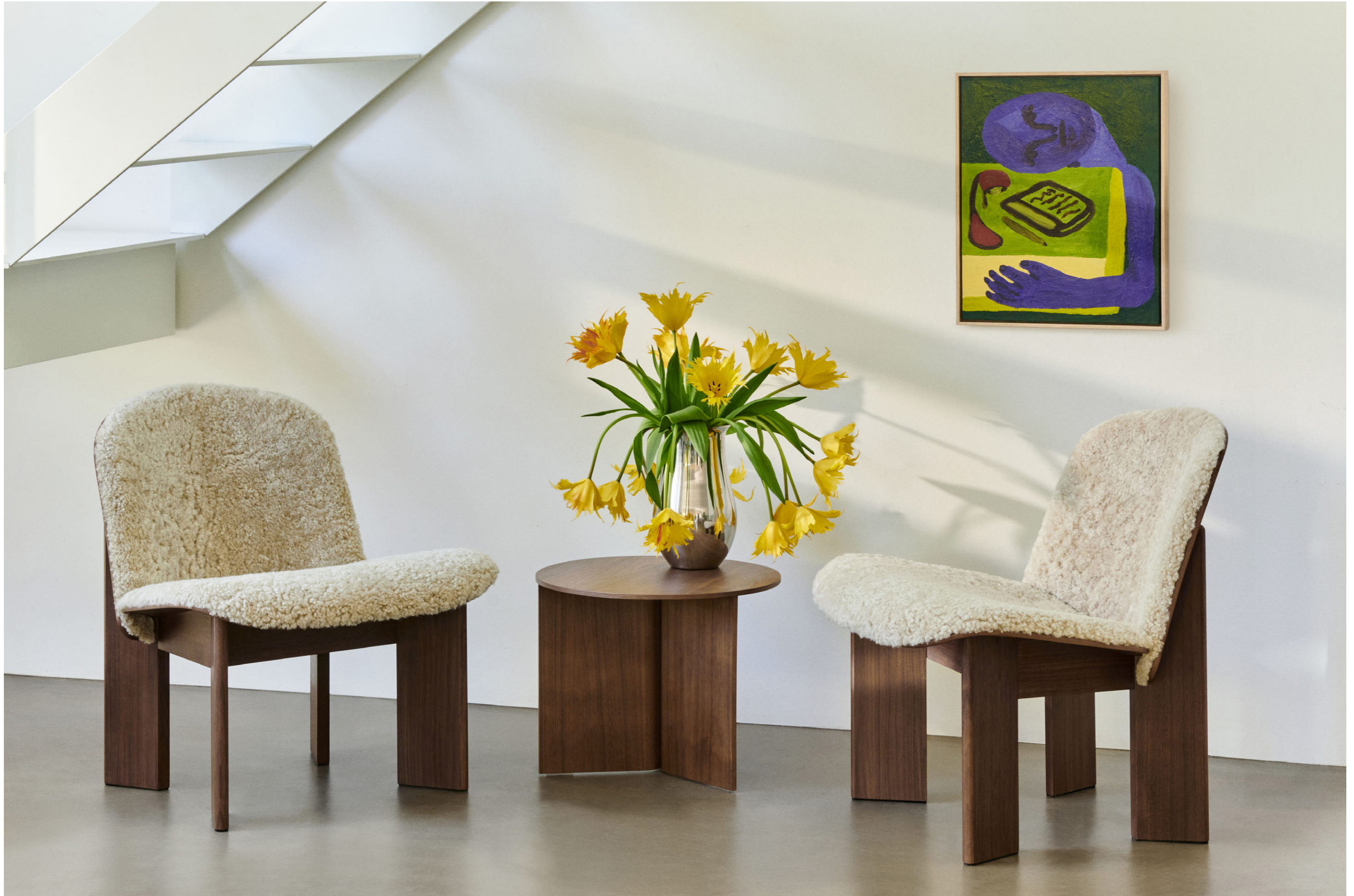
Chisel Lounge Chair | Sheepskin Mohawi 21 | Water-based lacquered walnut