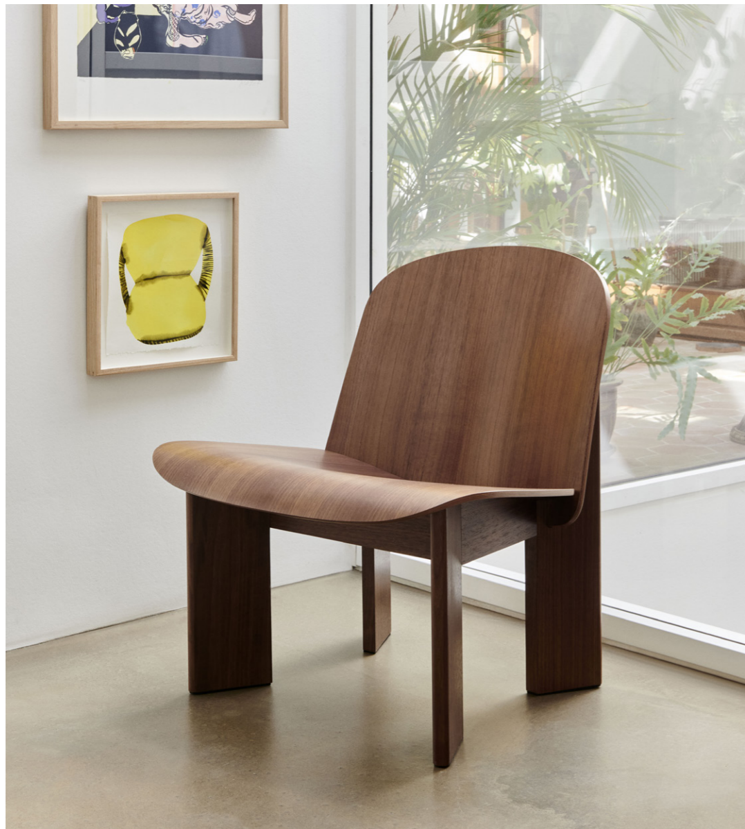
Chisel Lounge Chair | Water-based lacquered walnut