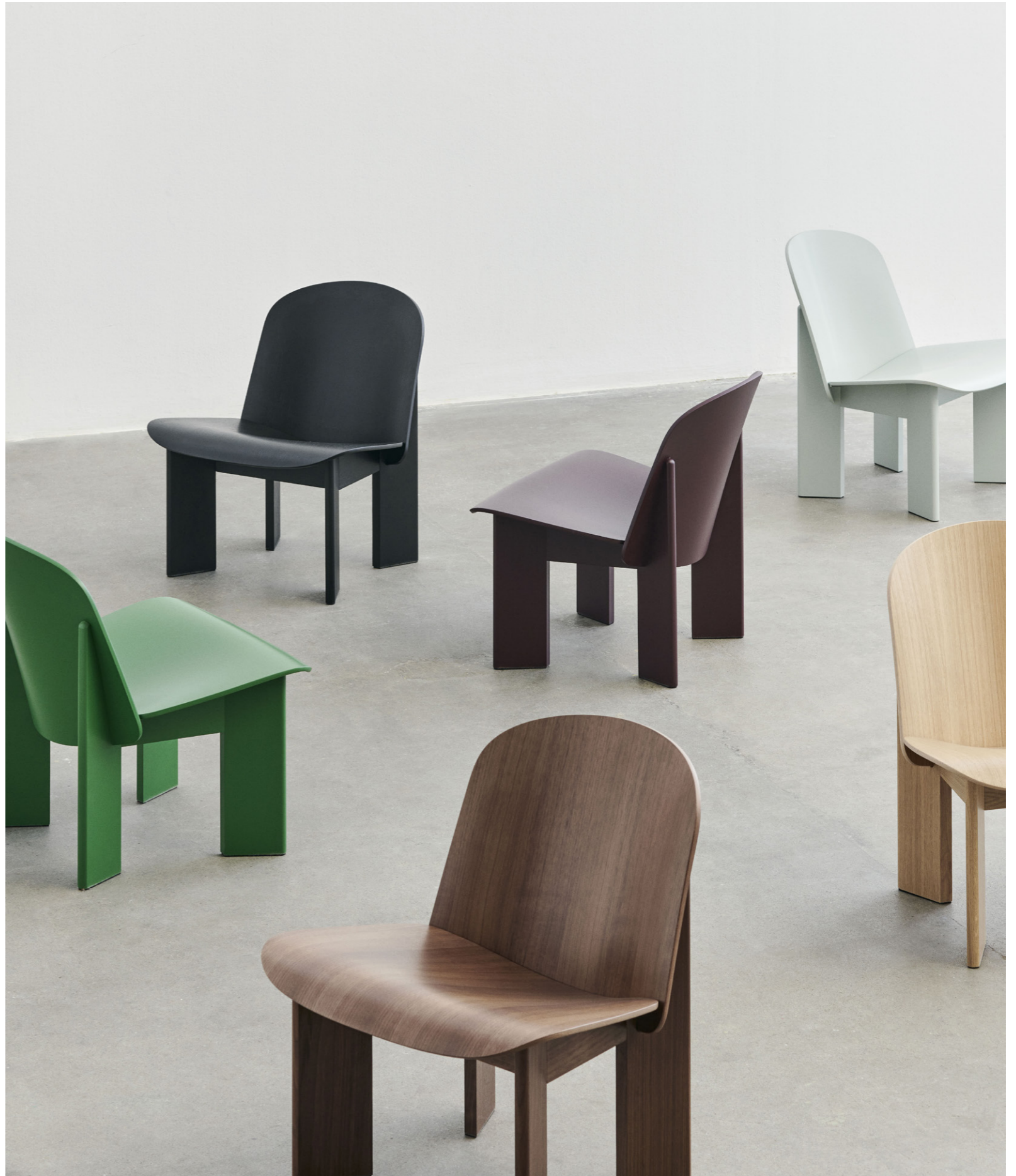
Chisel Lounge Chair Family