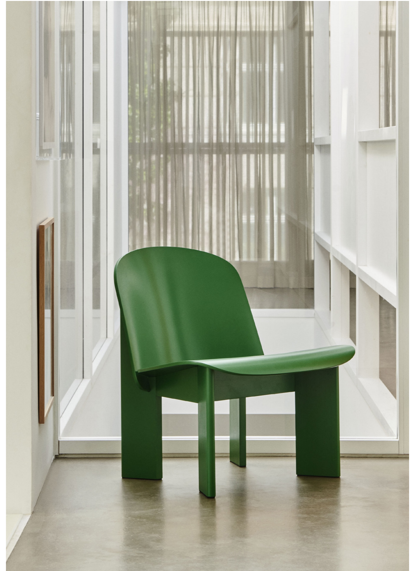
Chisel Lounge Chair | Lush green water-based lacquered beech