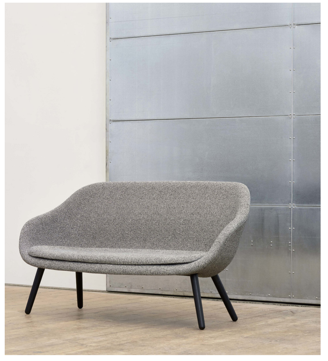
AAL Sofa | Sense black | Black water-based lacquered oak base