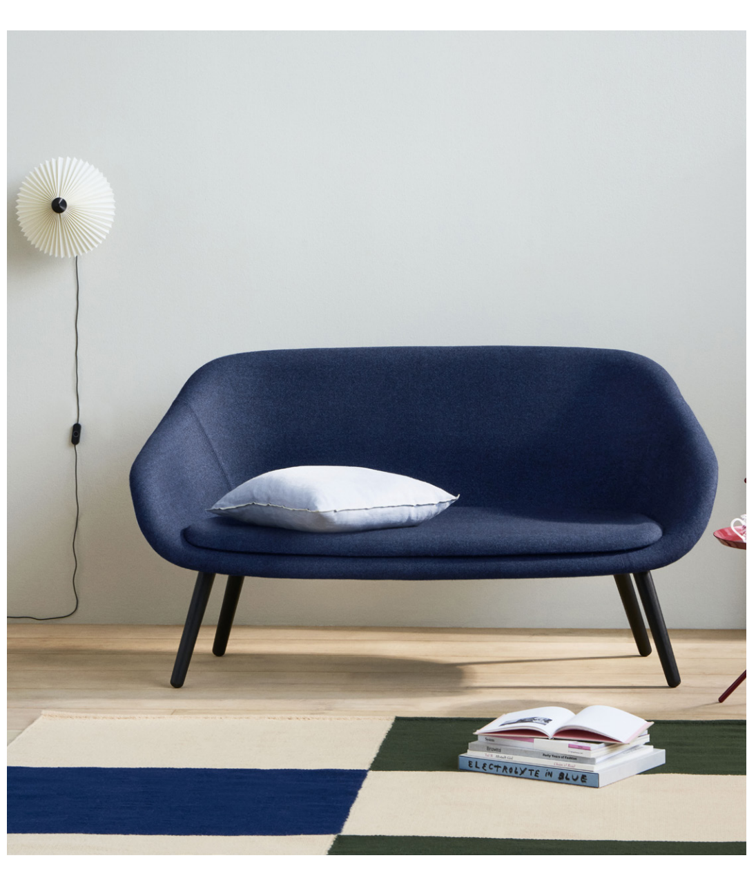
AAL Sofa | Hallingdal 764 | Black water-based lacquered oak base