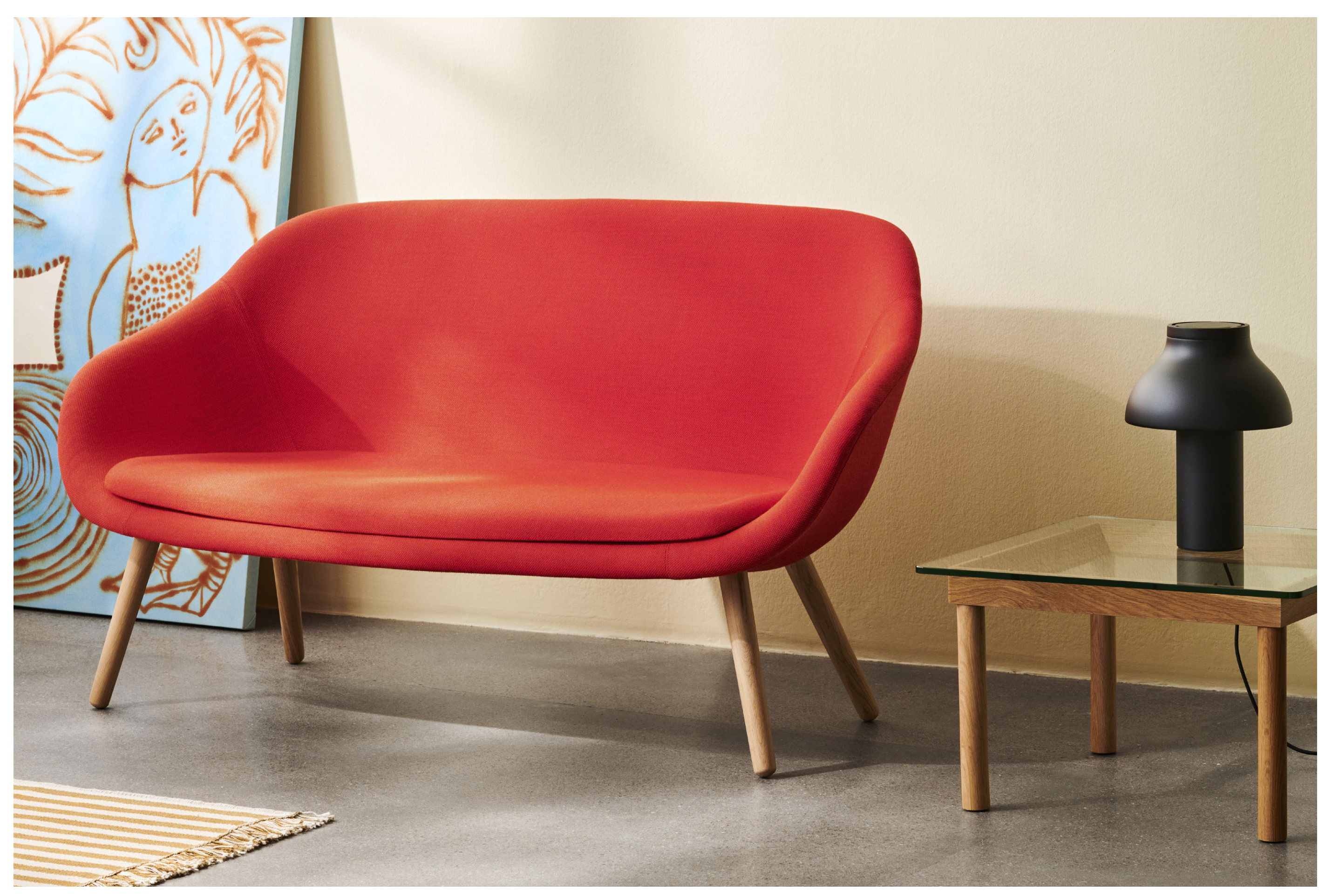
AAL Sofa | Fiord 571 | Water-based lacquered oak base