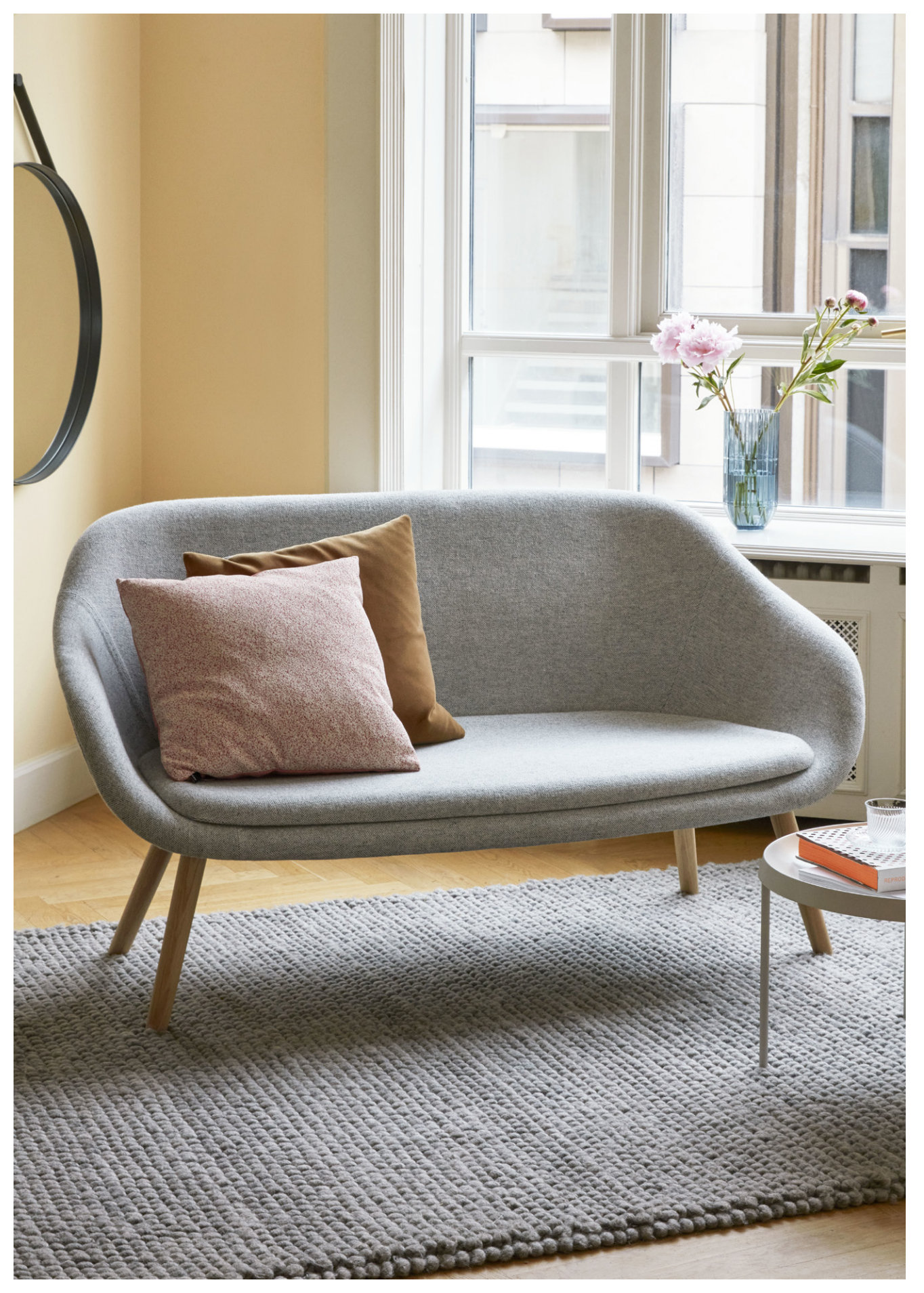
AAL Sofa | Hallingdal 116 | Water-based lacquered oak base

Sharing the same minimalistic principles and versatility as the rest of the series, About a Lounge Sofa is a cohesive fusion of two lounge chairs. With its curvy lines and organic expression, it invites close, intimate meetings at the same time as it offers an open and welcoming structure. The choice of oak finishes on the legs and upholstery colours and combinations allow you to create your own unique design. Incl. fixed seat cushion mounted with Velcro.