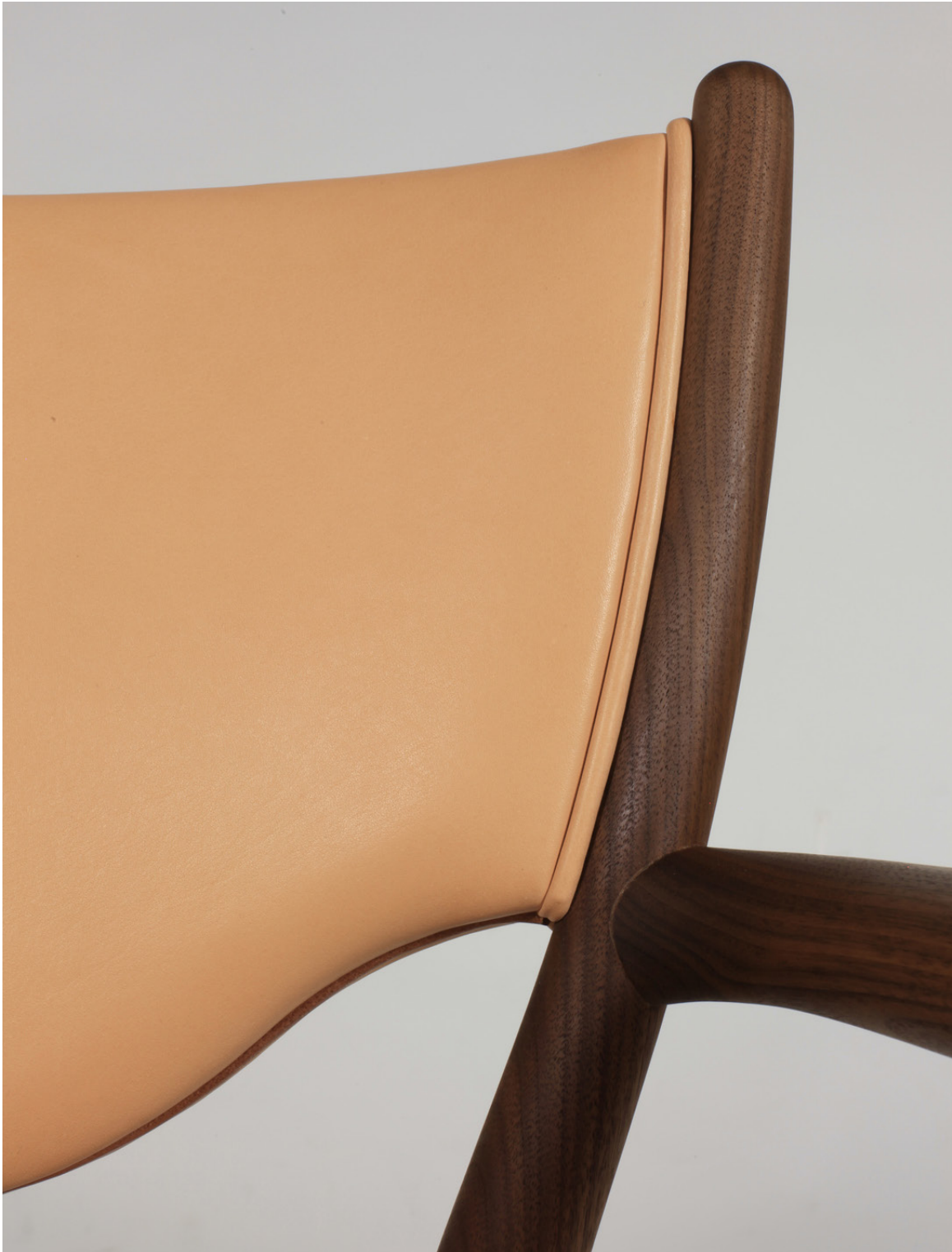
46 ARMCHAIR 1946 BY FINN JUHL