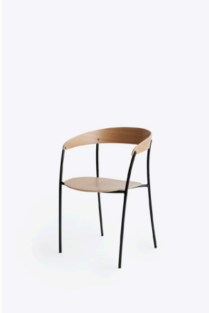
Laquered Oak w. Black Frame