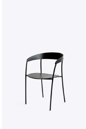
Black Lauquered Oak w. Black Frame