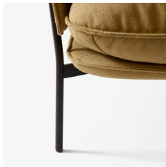
Warm black powder coating