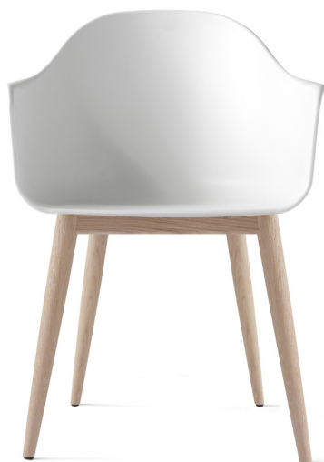
White Shell / Wooden Base 9362000