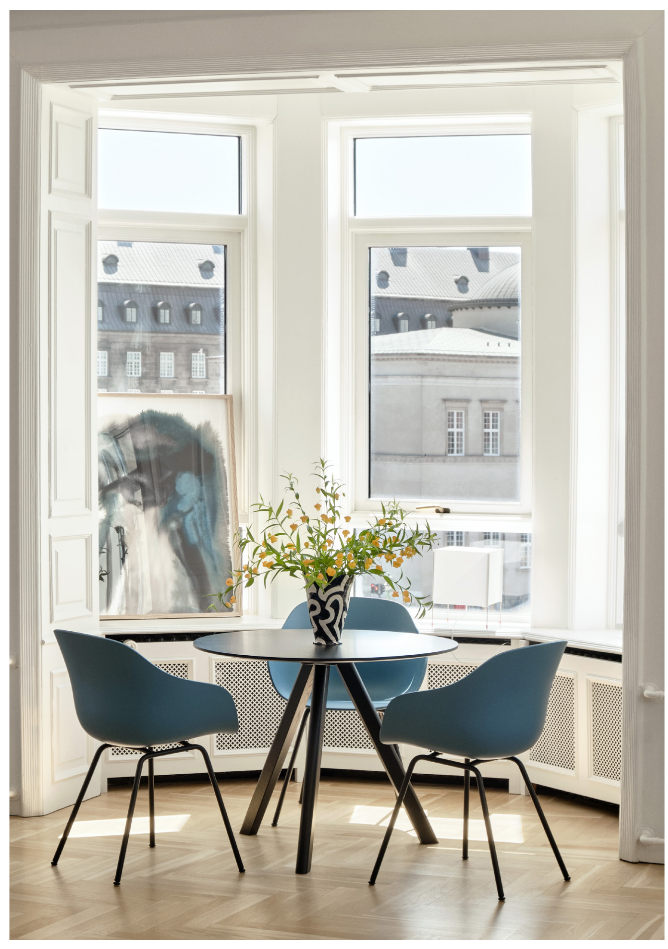
CPH 20 Ø90 | Black oak tabletop | Black oak frame

Sharing the same characteristic angled legs as the rest of the Bouroullec brothers' Copenhague range, the CPH20 table features a round tabletop that softens the engineered expression. The three-legged table frame comes in different sizes and is available with tabletops and frames in a variety of wood types, materials, and colours, with the possibility to select matching or contrasting combinations. Equally suitable for intimate meetings and larger, café-like environments, this versatile table has an ability to blend into private homes as well as public spaces.