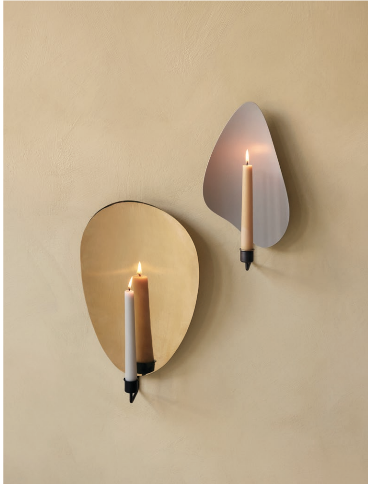
FLAMBEAU CANDLE HOLDER, WALL Designed by Krøyer-Sætter-Lassen